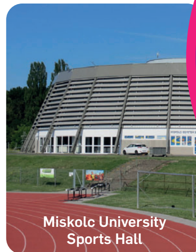
Miskolc University Sports Hall